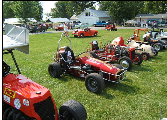
The featured cars for 2006 were special like these three quarter midgets. As the show ended, several went to the local racetrack.

CC and CD models lined the West side of the show field with the roadsters and race cars on the East. About 90 cars this year.